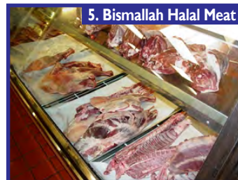
5. Bismallah Halal Meat