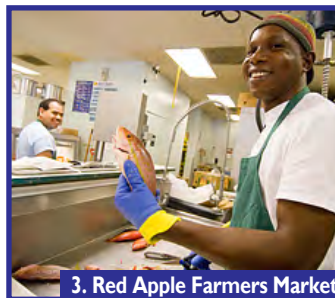
3. Red Apple Farmers Market

The New Ave is where you stock up on meat and fish, root vegetables, greens, sauces, spices, and legumes from all corners of the Earth. Whole worlds are contained in tightly stocked aisles; unpronounceable sodas, big fleshy fruits, freshly cut meats, and enticing smells. From shop owners that import specialty items, to butchers specializing in Halal meats (slaughtered according to muslim law), the New Ave is your culinary teacher. Happy hunting and bon-appétit!