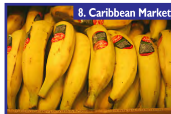
8. Caribbean Market