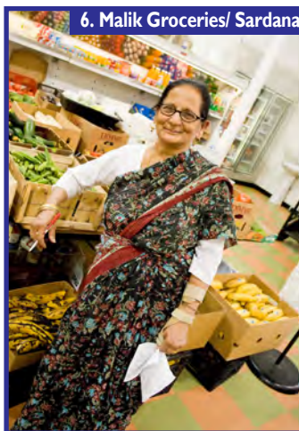
6. Malik Groceries/ Sardana