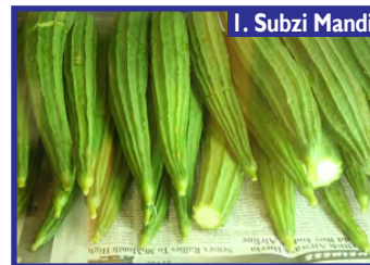
1. Subzi Mandi